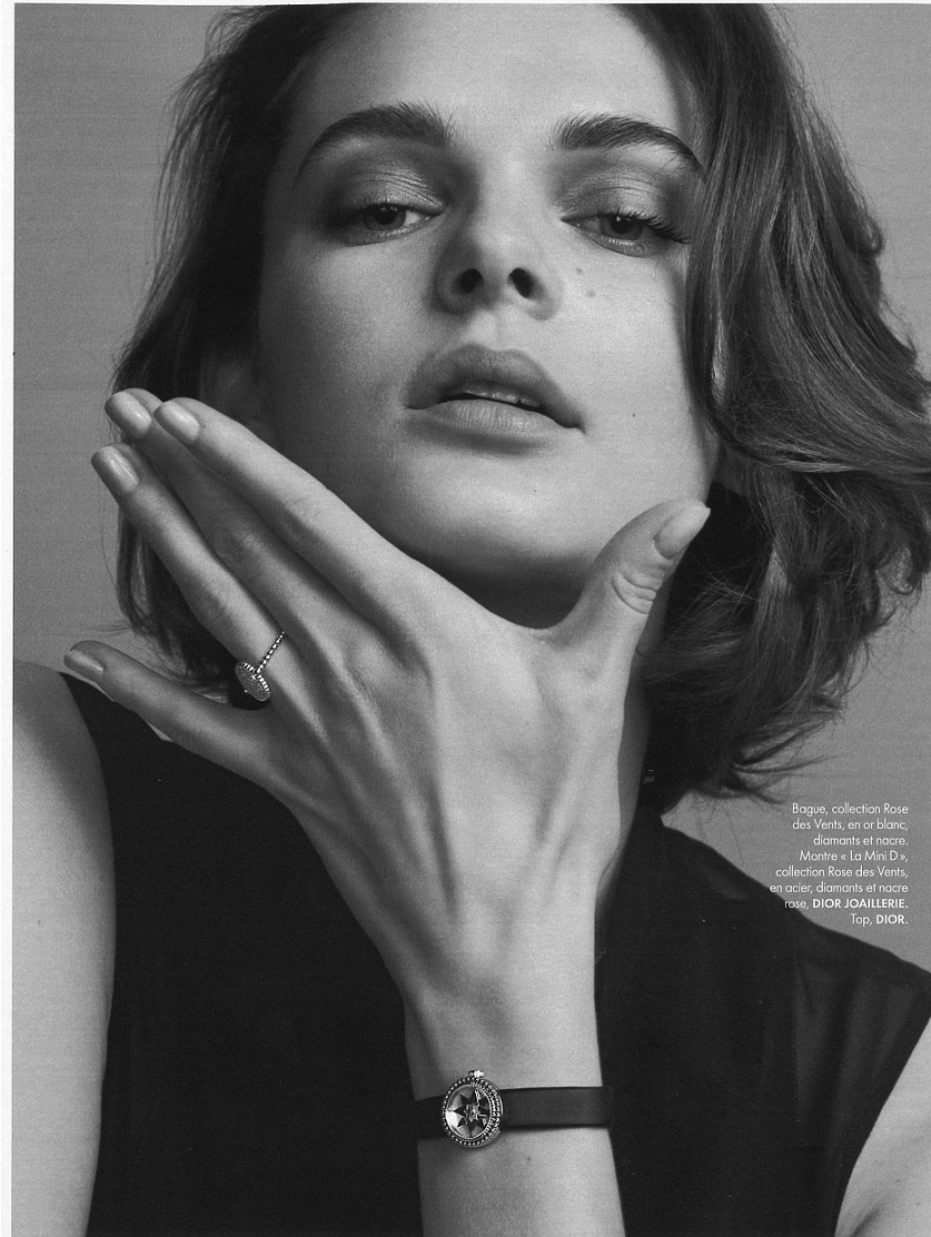
Bague, collection Rose des Vents, en or blanc, diamants et nacre. Montre « La Mini D », collection Rose des Vents, en acier, diamants et nacre rose. DIOR JOAILLERIE. Top, DIOR.