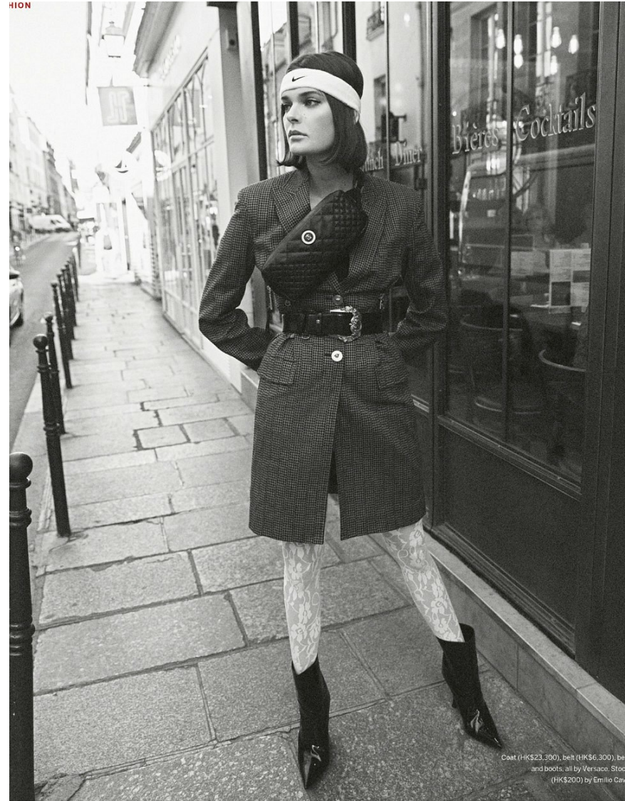
Coat (HK$23,300), belt (HK$6,300), bag and boots: all by Versace. Stockings (HK$200) by Emilio Cavallini.